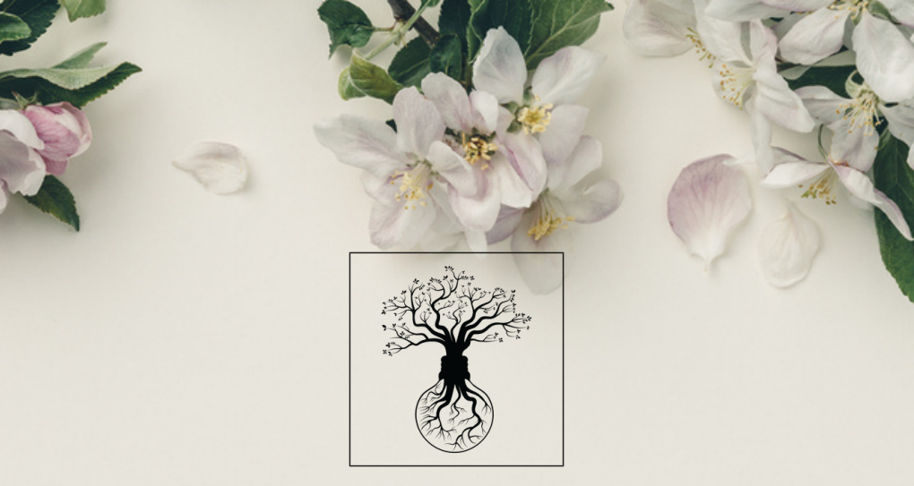
MB "Patirtys ir idėjos"

Hello! Meet the Metaphor-Question Cards.